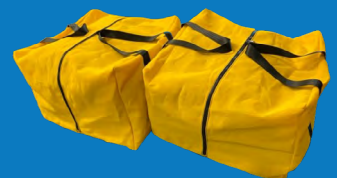
Optional Ground Mat Bag

DISCLAIMER: Chatoyer is not responsible for any product malfunctions, damage, or performance issues resulting from misuse, unauthorised modifications, improper installation, external environmental factors, or failure to follow recommended usage guidelines. This includes, but is not limited to, damage caused by accidents, natural disasters, power surges, or use with incompatible accessories. All warranties and support services apply only to products used in accordance with the manufacturer's instructions and within the intended operating conditions.