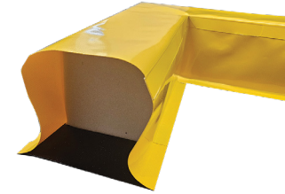
150mm HIGH PROFILE