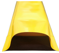
50mm LOW PROFILE