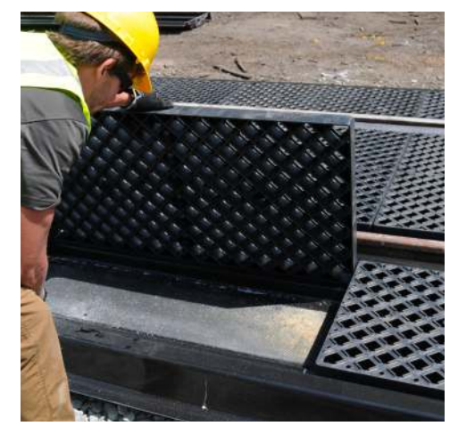
Optional polyethylene grating package available for safer foot traffic.