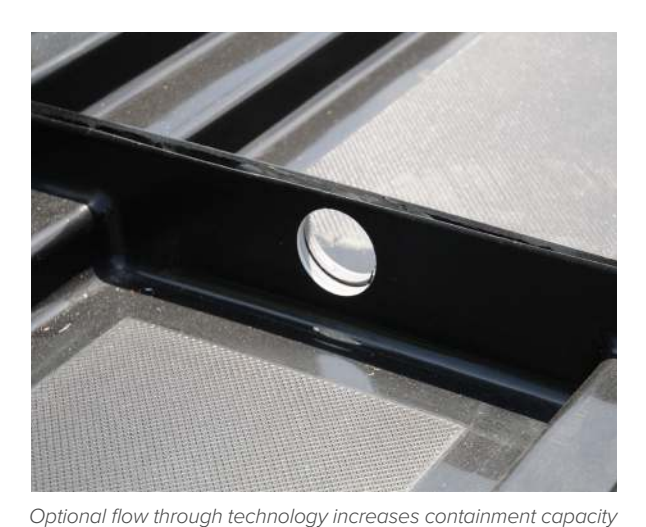
for larger spills while minimizing cleanup of smaller spills.