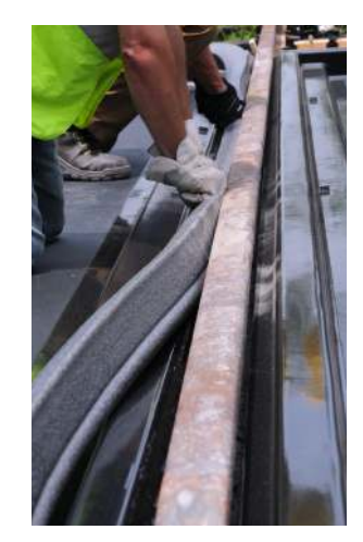
Optional rail side gaskets prevent leaking between rails and Track Pans.