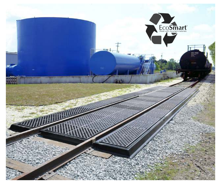
System shown includes one Center Pan (Part# 7200) and two Side Pans (Part# 7210)