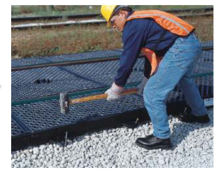
Side Pans are secured in place with 24" rebar fasteners. Typical installs require two pieces of rebar per Side Pan.